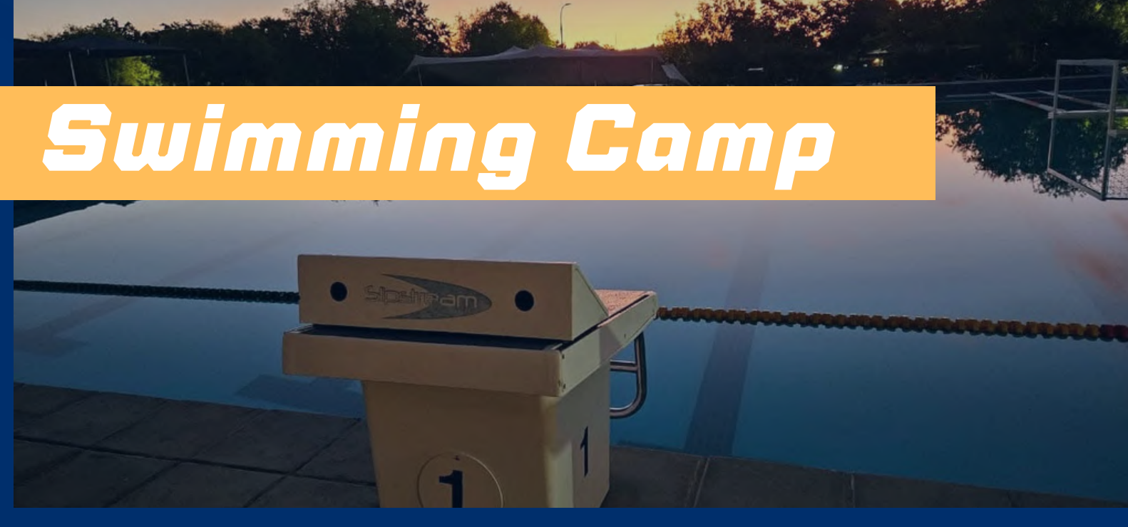
To kick off the 2025 swimming season, our swimming team had a camp right here at Rhenish to build enthusiasm and create excitement for the season ahead.